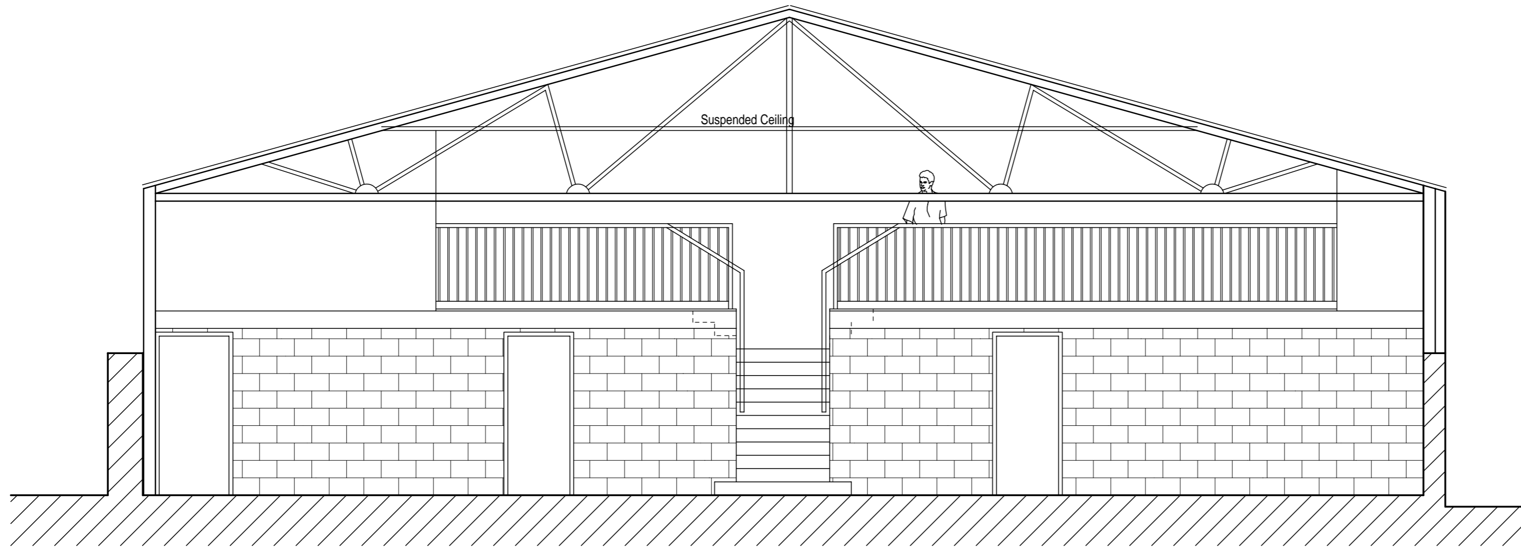
PROPOSED CROSS SECTION